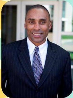
Roger Craig NFL Super Bowl Champion