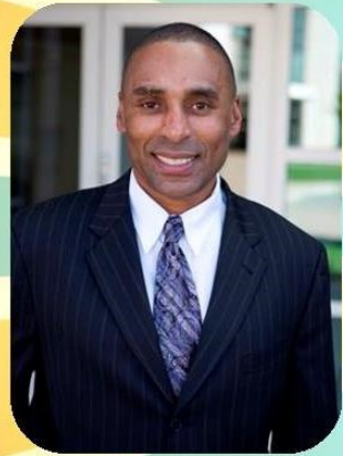
Roger Craig NFL Super Bowl Champion